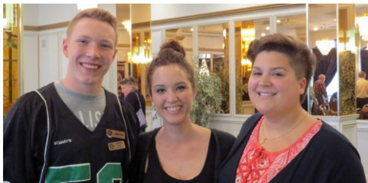
Our Youth Exchange Students